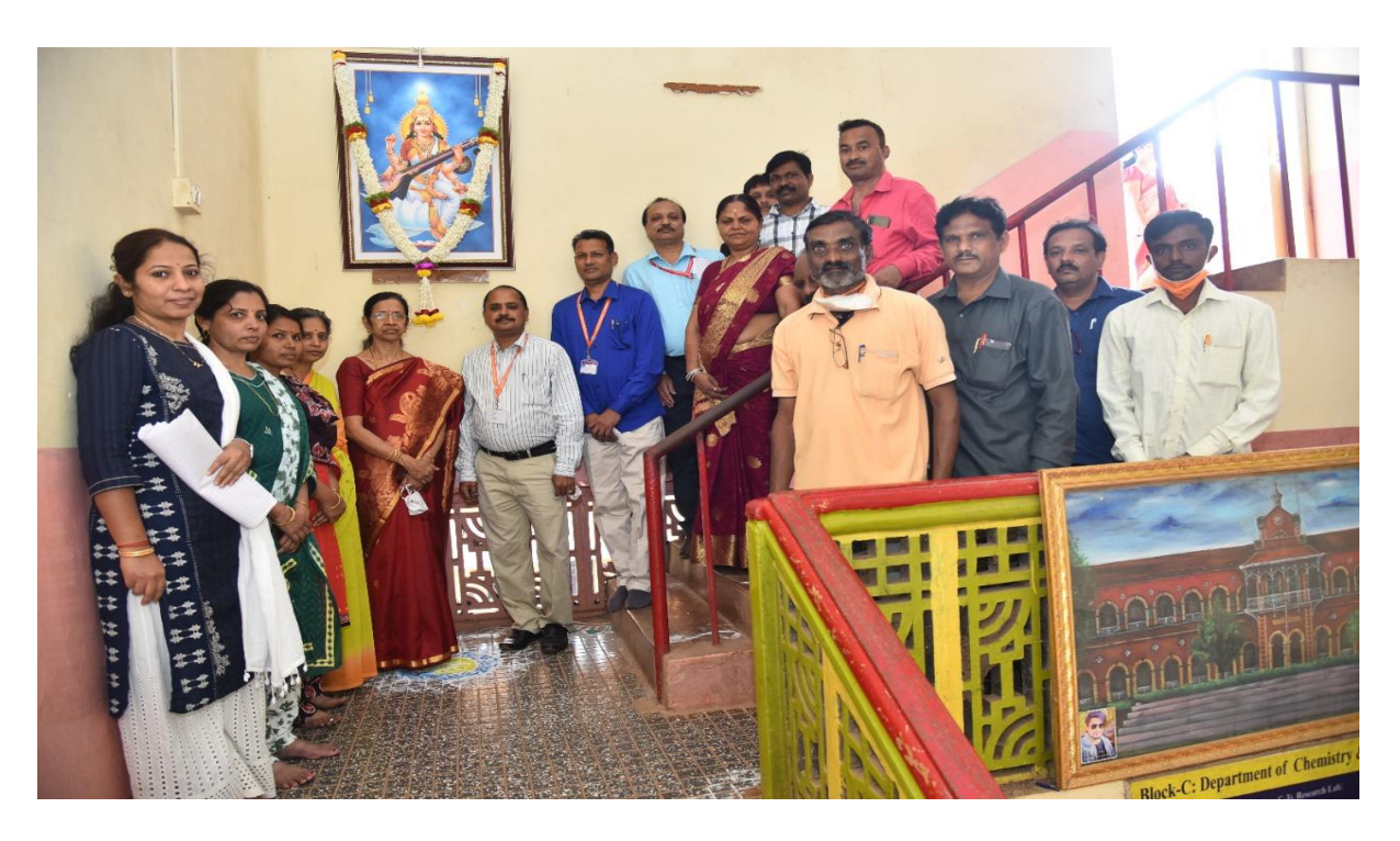
Teaching and Non-teaching staff performing Goddess Saraswati pooja