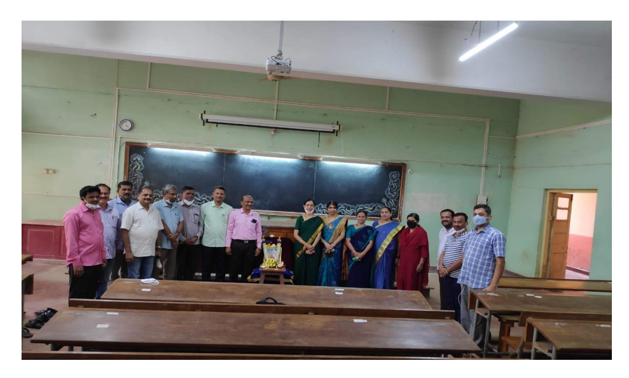
Celebration of Valamiki Day