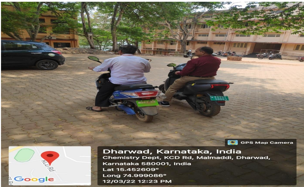
Staff members of the college using Battery-powered vehicles