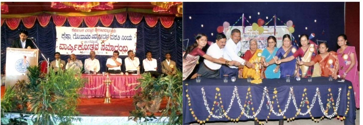
Krishna & Godavari Hostel