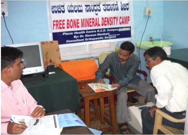
Bone density Camp on 9 th Oct 2010