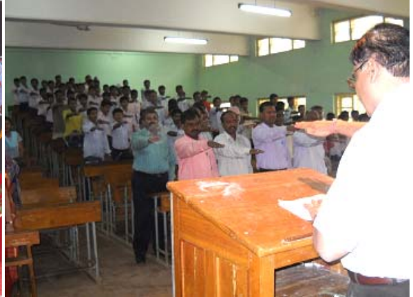
Celebration of Sadbhavana Day on 19 th Aug 2010