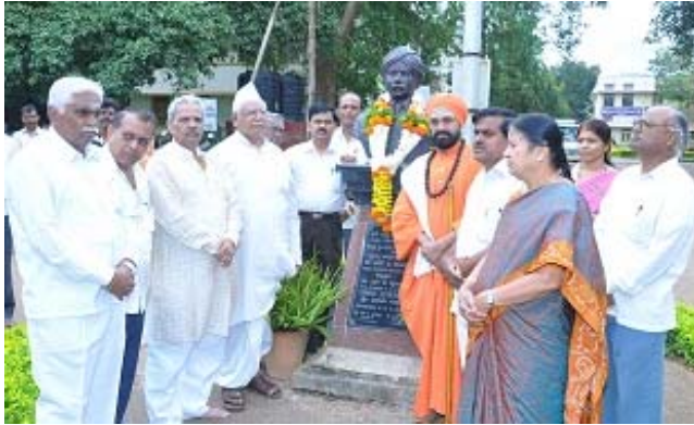
Founder's day celebration in our college