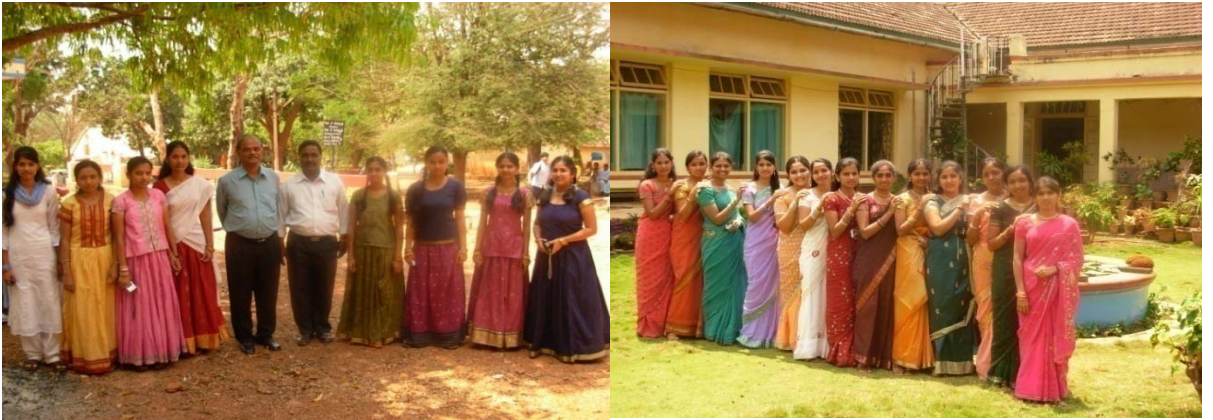
Celebration of "Traditional day" by our college lady students