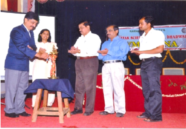
Personality Development & Interview techniques program on 25 th & 26 th April 2011