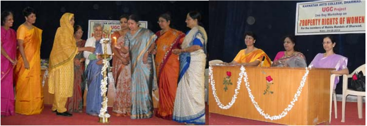
Inauguration of workshop on Property Rights of Women