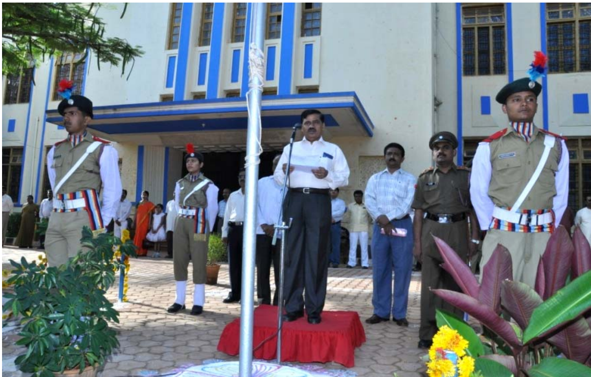
Independence day address by Principal