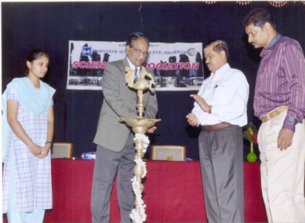
Inauguration of Science Association activities for 2010-11