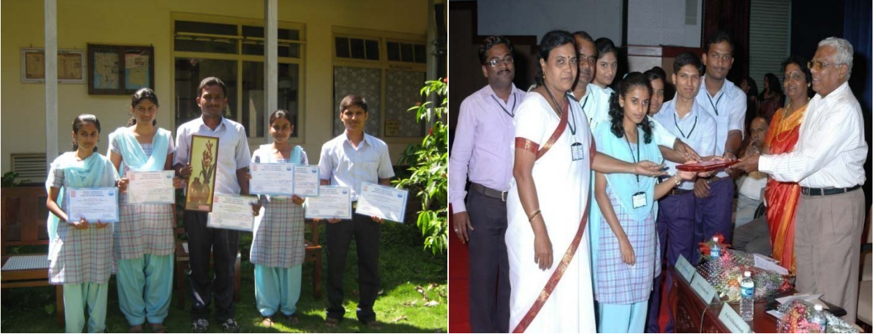
Students who got I prize for Poster presentation in a National conference on 'Climatic change and its impact on Natural Resources' at Bangalore University, Bangalore.