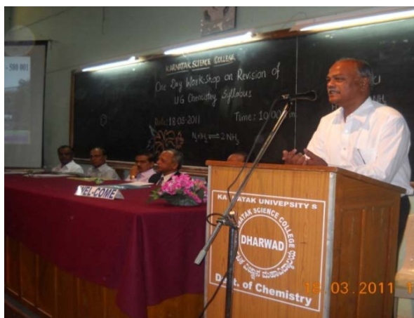
Workshop on Revision of Chemistry UG syllabus Conducted by Dept. of Chemistry on 18 th March 2011