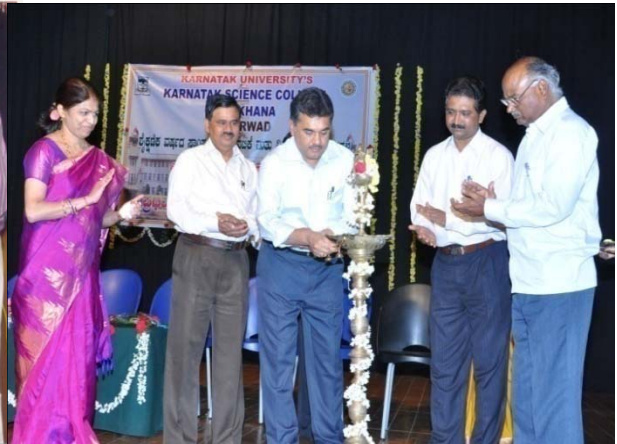
Inauguration of Gymkhana activities